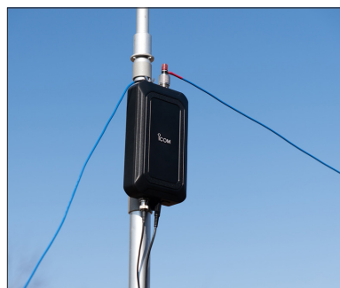
Wire antenna installation example