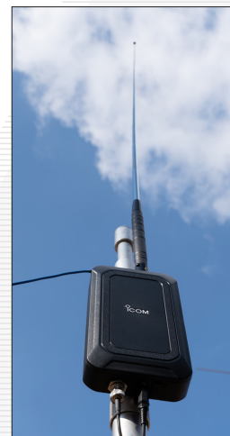
50 \Omega antenna example